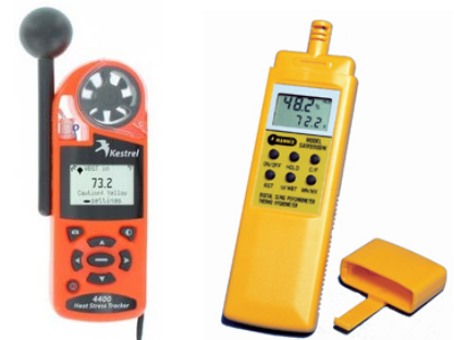
Examples of WBGT monitors